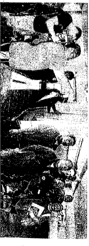
SPC trainer Brad Moore and trainees at the Happy Fish Market yesterday.